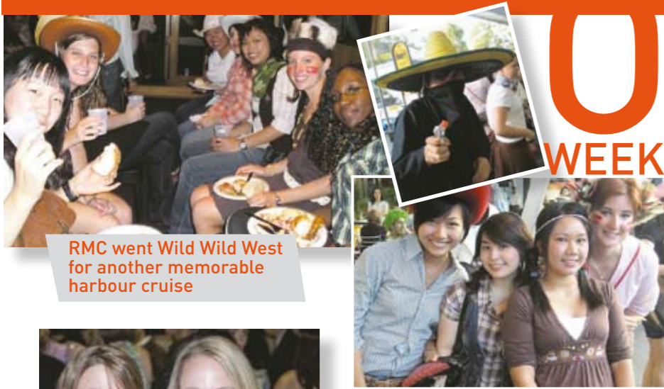
RMC went Wild Wild West for another memorable harbour cruise