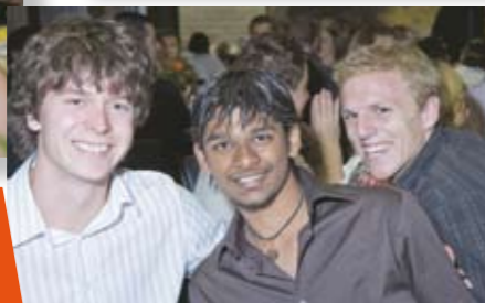
Around 220 smiling faces packed into the Dining Room for a great start to the academic year at RMC