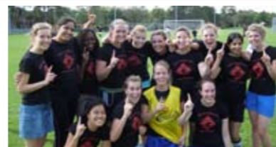
Women's sport is on a roll this year at RMC, having clinically disposed of DLC in both cricket and soccer so far