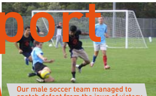
Our male soccer team managed to snatch defeat from the jaws of victory in an exciting tussle against DLC