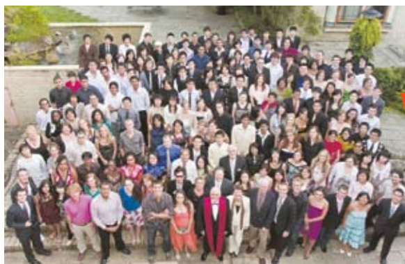
The official College photo in the courtyard before Commencement Dinner