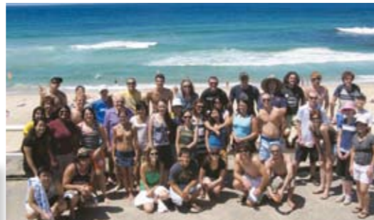
Another stunning Sydney day for the annual O-Week beach crawl from Clovelly to Bondi