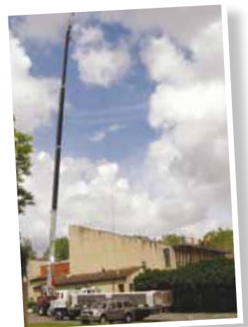
RENOVATION BLITZ - The 1990's Toyota Corollas had to make way for the crane in the student car park as the Dining Room roof was lifted away.