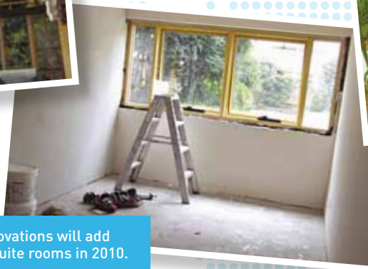
Summer renovations will add four new ensuite rooms in 2010.