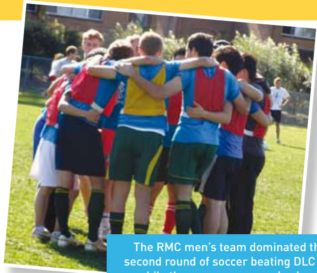
The RMC men's team dominated the second round of soccer beating DLC 3-0 while the women managed a draw.