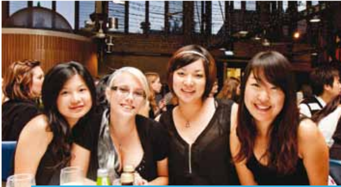
VALEDICTORY DINNER 2009