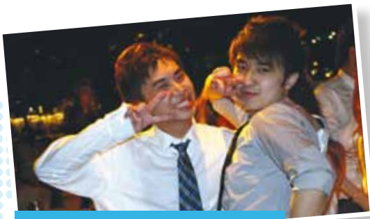
RMC BALL 2009