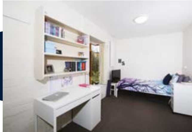
A, B, C & D BLOCK Single room with shared bathroom

Everyone's different - so we have mix and match options. Check the website for up to date costs.