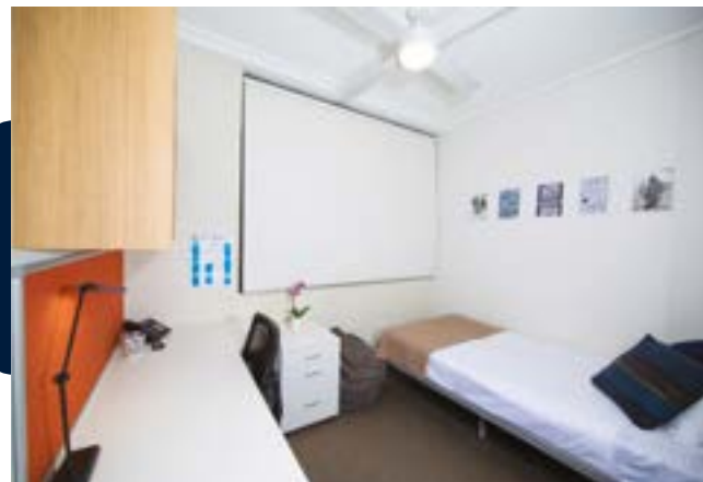
S BLOCK Single room with ensuite