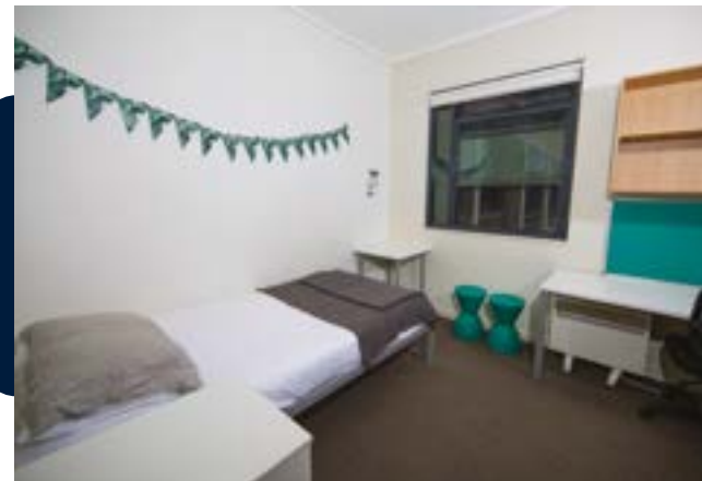
N BLOCK Single room with ensuite and kitchenette